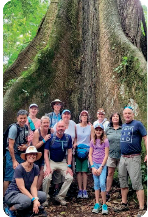
The group under a 400-year old Ceiba tree on the Arenal volcano. It survived the eruption of 1968, which decimated everything else in its path.

Go to alumni.umw.edu and search for "On the Road" for information on the next trip!