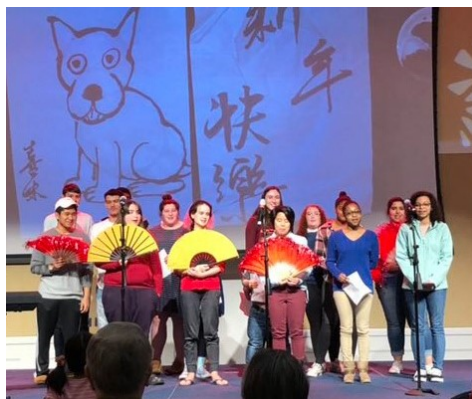
Chinese New Year Celebration. 2/24/2018

Social Media: Stay up to date with Modern Languages and Literatures all year by following us on Facebook, Twitter and Instagram . We're easy to find... search umwmdll on all 3 sites and then Like, Follow and Share!