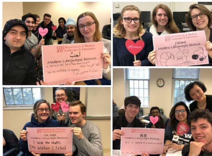
For Valentine's Day, Our students shared what they love about Modern Languages