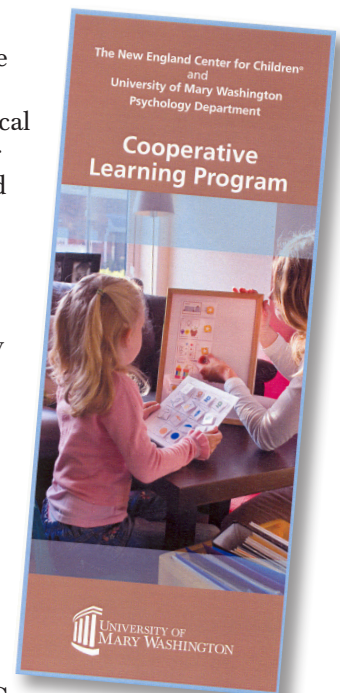
Cooperative Learning Program Brochure

Students enrolled in the Cooperative Learning Program take two courses that can count as UMW psychology major electives. The courses from which they can choose are Behavior Assessment, Advanced Learning, Programmed Learning, Research Methods and Design in Applied Behavior Analysis, and Systematic Inquiry in Applied Research. In addition, students spend approximately 30 hours per week serving as student teachers. For this hands-on component of the program, students earn internship credit, which can fill a requirement for the psychology major as well. Scheduling of