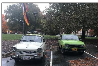
Two GDR-era cars, a Trabant & Wartburg, on display in front of Combs Hall.