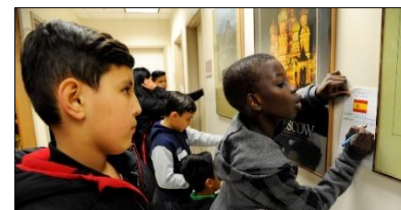
Local ESL students take part in a scavenger hunt in Combs Hall.