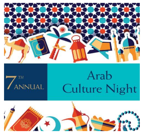
This annual March event, brings together Arabic music, dance, fashion, and of course, great food!