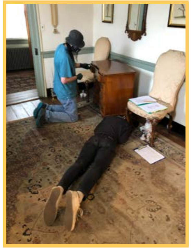
Sometimes you have to get creative to investigate every nook and cranny of larger pieces