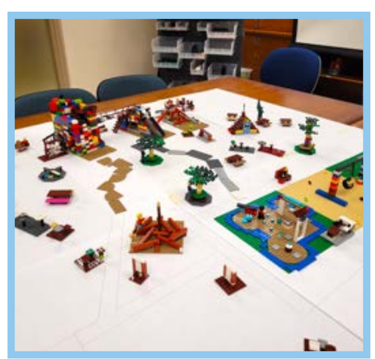
Lego Kenmore Park created by students to visualize features and the spatial relations between the apparatuses and play areas