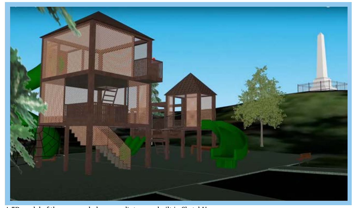
A 3D model of the proposed playground's towers, built in SketchUp

To redesign the site, students worked in a studio-style group format. On the foundation of the data they collected and the research they conducted, they began designing new equipment for the park to address the park's current weaknesses while also utilizing its strengths. Each student brought their unique skill set to the team effort. Some worked primarily on the GIS mapping and the 3D-SketchUp model of the park. Others created the photo renderings of sidewalks and the signage to add to the park, using Adobe InDesign and Adobe Illustrator. Some focused on editing the final report and drafting the final presentation. All students collaborated on writing the report and workshopped the different chapters together.