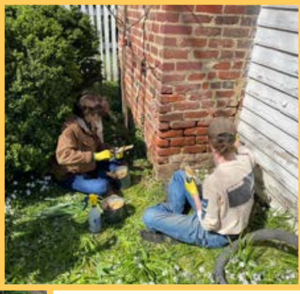
After removing harmful Portland cement by hand, students apply fresh lime mortar to sections of the Mary Washington House foundation