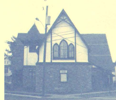
View from corner of Prince Edward and Hanover.

Sometime during my freshman year I rode past a strange stone and frame Fredericksburg structure and thought, "Whoa, what an awesome building!" Since then I have been fascinated by the church at the corner of Hanover and Prince Edward streets. Once Trinity Episcopal Church, it is now Fredericksburg Full Gospel Fellowship, a small Pentecostal congregation. It was built in 1881 and is a stunning example of Victorian Gothic Revival, and certainly rather unique for Fredericksburg.