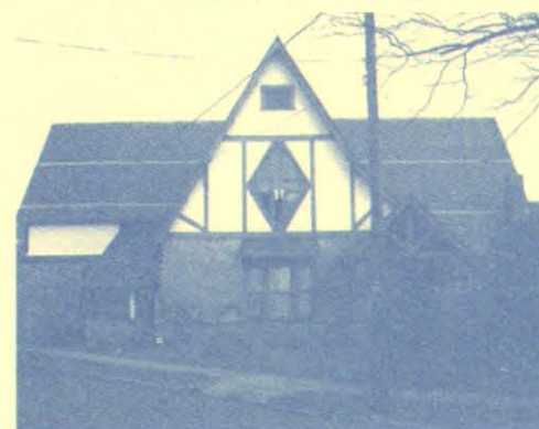
Fredericksburg Full Gospel Fellowship as seen from Hanover Street.

As the semester wraps up, I will be meeting with leaders of the church and discussing the report, as well as speaking to the congregation about how wonderful their building is as a house of worship to God.