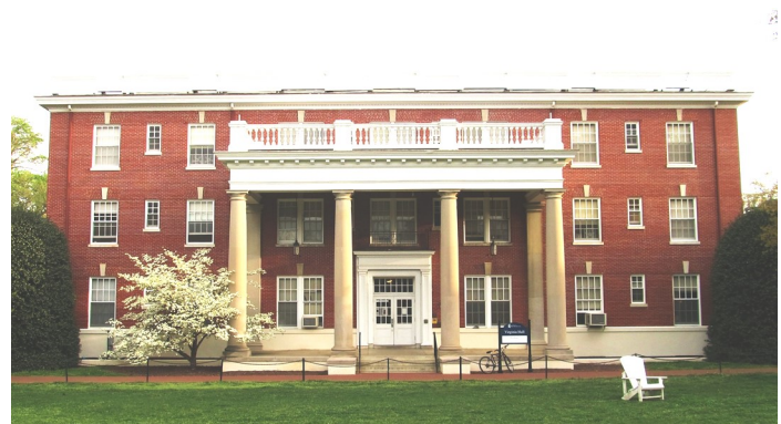
Virginia Hall, Ball Circle Side; 2015; Laura Gilchrist