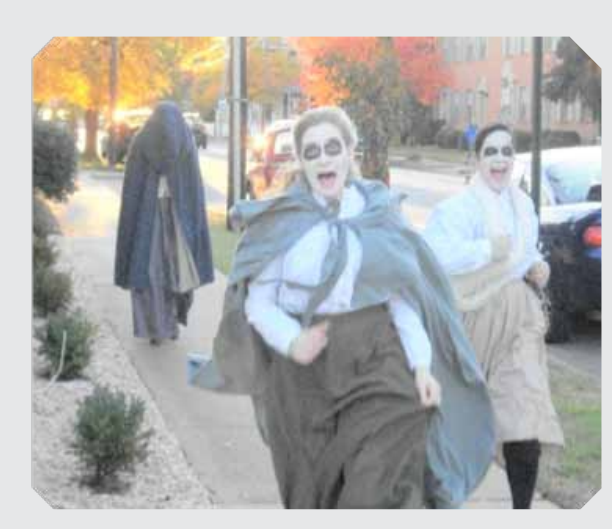
Students having fun as ghosts