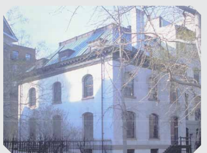
The Neighborhood Preservation Center New York City, Katharine Fields '15

various historic buildings on a particular block. The front of each handout included both historic and current photos of an existing historic structure along with a short history about