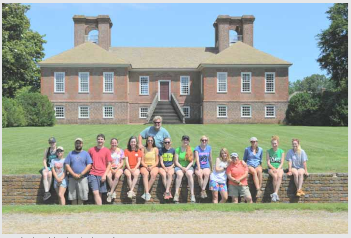
Stratford Field School Class of 2014