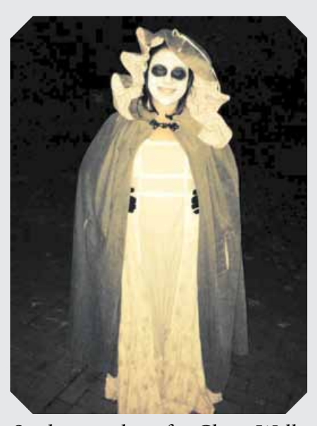
Student as ghost for Ghost Walk