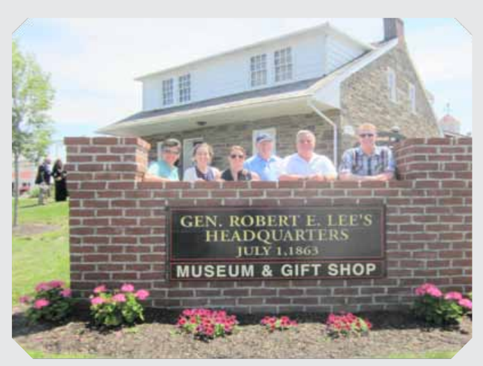
National Park Service American Battlefield Protection Program staff in Gettysburg, PA on July 1, 2014.

Since graduating from Mary Washington in 2011, I have worked in several Washington, D.C. cultural heritage institutions, including The National Archives and Records Administration, The White House Historical Association, and the Smithsonian National Air & Space Museum. But my position this summer with the National Park Service's American Battlefield protection program most closely corresponded with my undergraduate studies in Historic Preservation. During my internship I edited draft easements to protect battlefields with the Land and Water Conservation Fund, planned a social media campaign for the 50th anniversary of the National Historic Preservation Act, and assisted in the grant program sponsoring preservation projects on historic battlefields. I also attended an orientation held at the National Trust for Historic