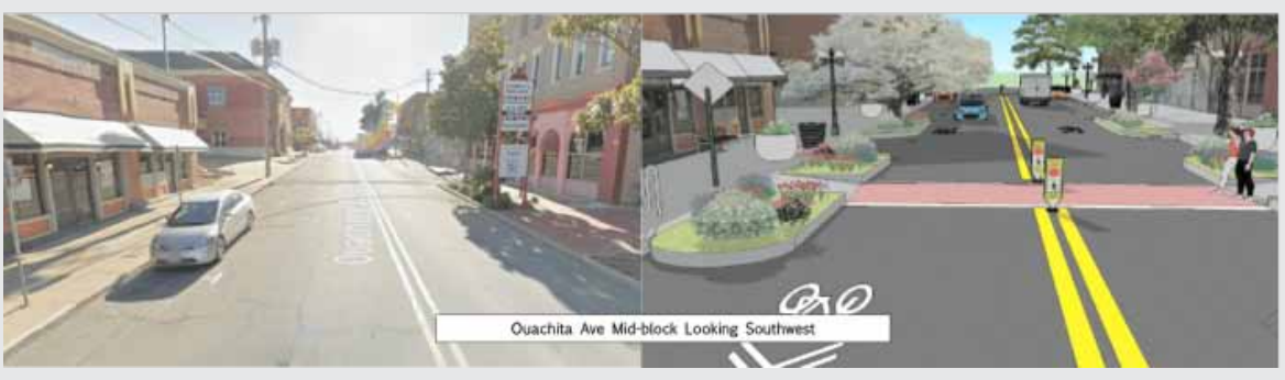
Daniel Messplay's rendering of Quichita Avenue- Left: Current view; Right: Proposed changes