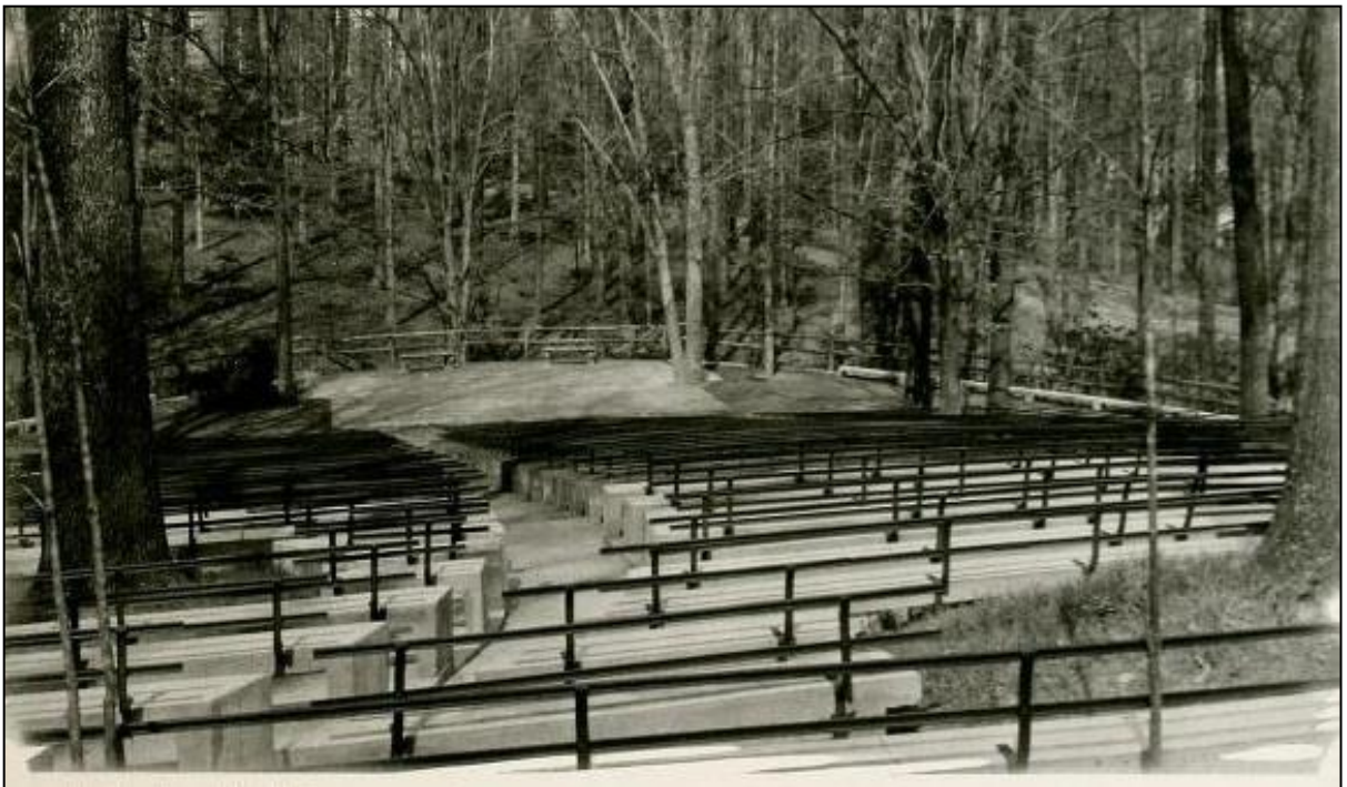
Figure 24: Image showing the amphitheater in 1938 with the stage structures now gone. The audience seating has been expanded on the sides and towards the rear. Upon close inspection the original, 1923 stage can still be seen as a lighter color. (Battlefield, 1938, pg. 33)