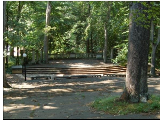
Figure 21: Image of the UMW Amphitheatre in 2012. (Spencer, 2012)

“We have a beautiful grove and in a portion of this grove naturally graded for the purpose, we constructed, about eight years ago, a temporary open-air theater. The stage, a cheap wooden structure, has rotted down several years ago and the benches which were used at the time are no longer serviceable.” 203