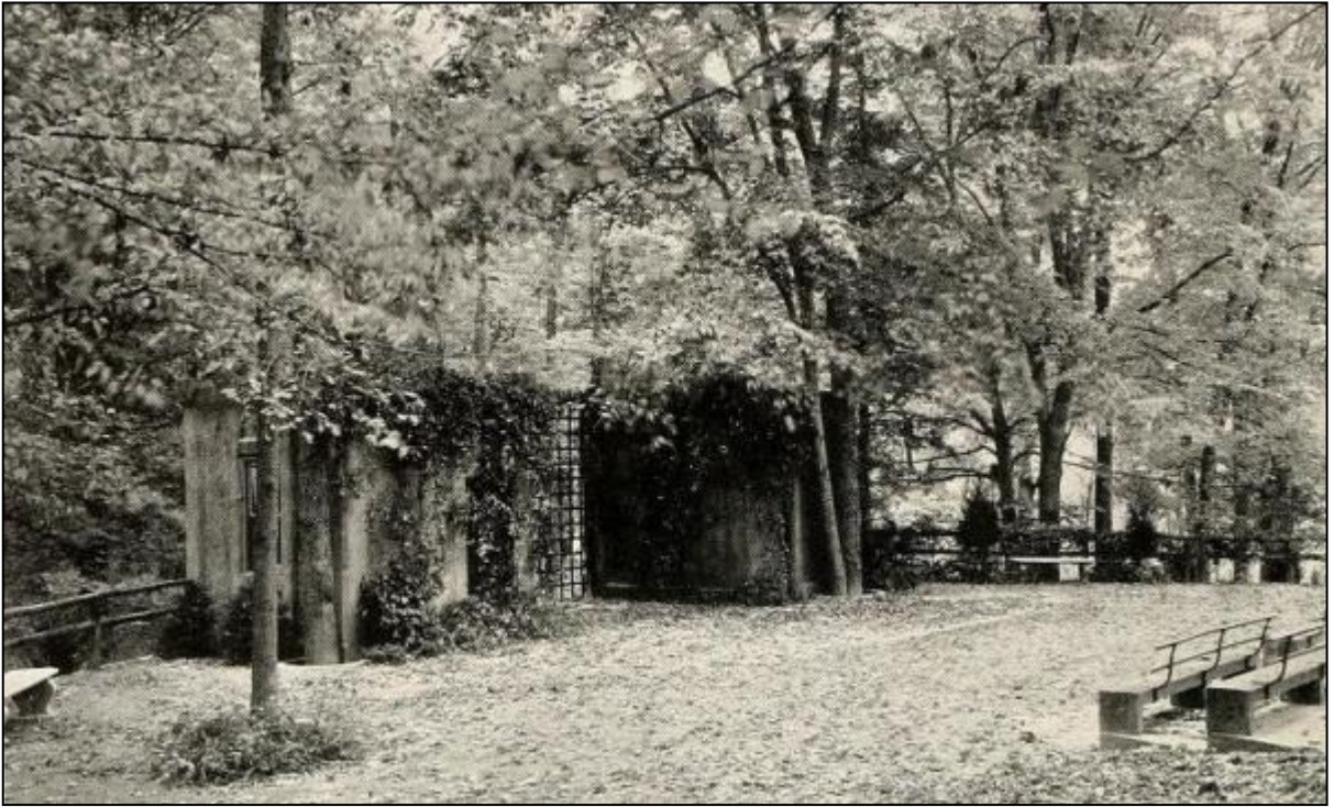
Figure 23: Image showing the UMW Amphitheatre in 1934. Note that the 1923 structures are still present on the stage which has been expanded significantly. (Battlefield, 1934, pg. 102)