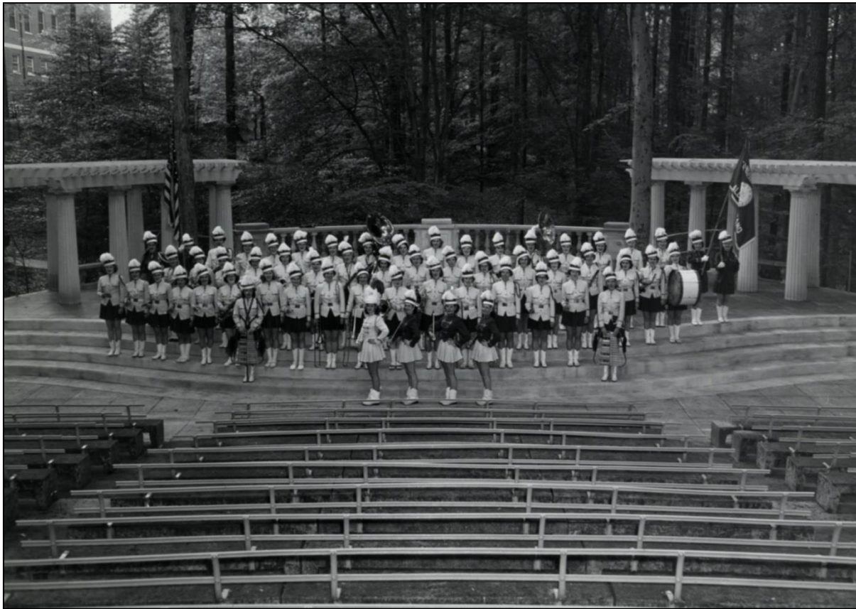
Figure 25: Image, likely from the late 1950s, showing the completed cast stone balustrade as well as Doric columns and wood pergolas. Note that the stage has been raised necessitating that the large branch of the Beech tree encapsulated on the right side of the stage, as seen in the previous image, be cut off. The steps now follow a serpentine pattern.