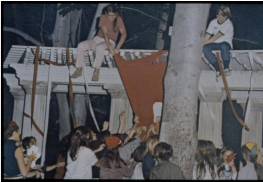
Figure 26: Devil Goat Day celebrations in the amphitheater, note the presence of the pergola as late as 1971 when the image was taken.