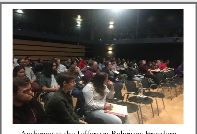
Audience at the Jefferson Religious Freedom Lecture